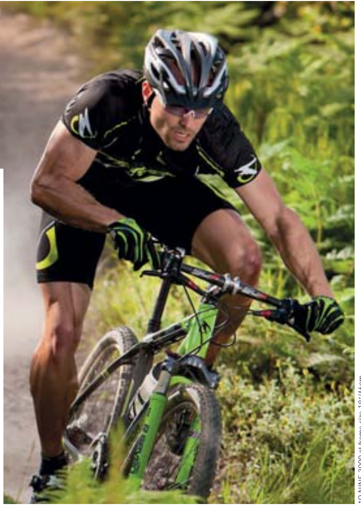
*O.NINE 3000 at frame size 18"/46cm

Your bike for the winner's podium – MERIDA O.NINE!